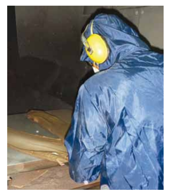
WORKER SANDBLASTING IN BANGLADESH.

According to the Solidarity Committee of Sandblasting Labourers approximately 600 workers have been diagnosed with silicosis in Turkey in the last decade, but the Committee fears that this number could rise to almost 5000. The fact that many of the workers are or have been employed within the informal sector or at unregistered companies means that they do not have any proof of employment, which means that they are not eligible for social security benefits or compensation. The Committee demands that all sandblasting workers should have the right to medical care, including a physical examination and treatment, guaranteed by the government, regardless of their social security status. Further, the Committee demands that workers who have been diagnosed with silicosis should be given the immediate right to social security and pensions, even during ongoing legal battles.<sup>27</sup>